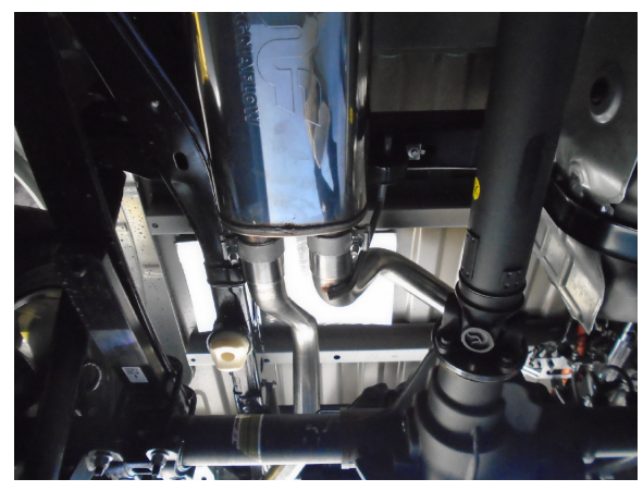
Step 4. Install both the Over Axle Pipes using the supplied 2.50" clamps. Locate the welded hanger to the OEM rubber insulator.