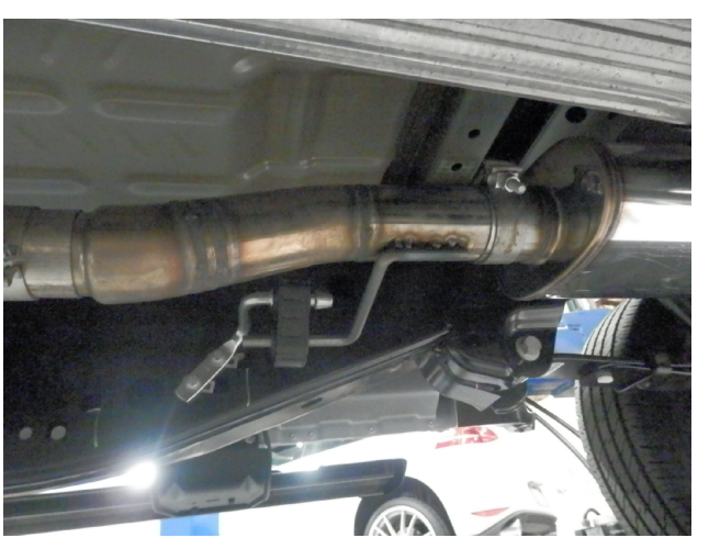
Step 2. Begin installing the new system by first using Table 1 . to determine which Inlet Pipe Assembly to use for your vehicle. Once determined attach the Inlet Pipe Assembly to the OEM catalytic converter outlet pipes using the existing clamp and hardware. Locate the welded hanger to the rubber insulator. Leave all clamps and fasteners loose for final adjustment of the complete system once installed.

Before installing your new MAGNAFLOW system the OEM spare tire and spare tire heat shield must be permanently removed.