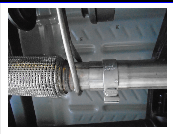
Step 1. To remove the OEM exhaust system, loosen the clamp attaching the systems inlet pipe to the catalytic converter outlet pipe. Disengage all welded hangers from the OEM rubber insulators. Do not discard the OEM fasteners or damage the rubber insulators as they will be needed to mount your new MAGNAFLOW system.