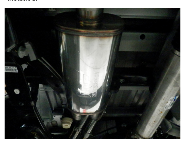
Step 3. Attach the Muffler Assembly to the Inlet Pipe Assembly with a supplied 3.00" clamp, fit the hanger into the rubber insualtor.

MAGNAFLOW: 1901 Corporate Centre Dr - Oceanside, CA 92056 | 1(800)990-0905 Technical Support: 1(800) 959-9226 | Email: moreinfo@magnaflow.com