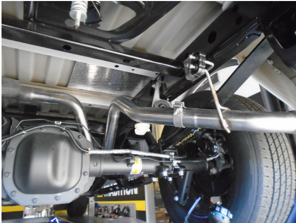
Step 5. To allow for the installation of a dual outlet system on a single outlet vehicle you will have top mount the supplied Hanger Brackets to existing holes in the factory frame rails using the supplied fasteners (8mm bolt and panel nut) as shown in the photos. Once completed you can now slide the Tailpipe assemblies onto the Over Axle pipes and fasten with the supplied 2.50" clamps and mount the hangers to the installed hanger brackets using the supplied rubbber insulators.