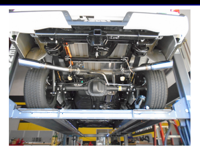
Step 6. Once a final position has been chosen for the new exhaust system, evenly tighten all clamps from front to rear using the torque specifications on page one of the instructions. Inspect all fasteners after 25-50 miles of operation and re-tighten if necessary.

MAGNAFLOW: 1901 Corporate Centre Dr - Oceanside, CA 92056 | 1(800)990-0905 Technical Support: 1(800) 959-9226 | Email: moreinfo@magnaflow.com